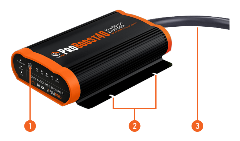
Figure 1: The ProBoost