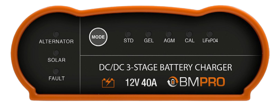
Figure 2: ProBoost Display Panel