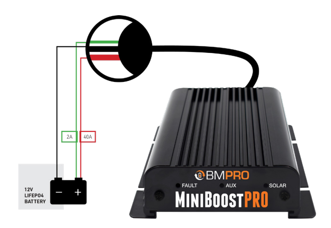
Figure 4: Selecting the 12V LiFePO4

When using the MiniBoostPRO to charge a 12V LiFePO4 Battery, connect the green wire to the secondary / output battery positive terminal. This will set the output voltage at 14.6V.