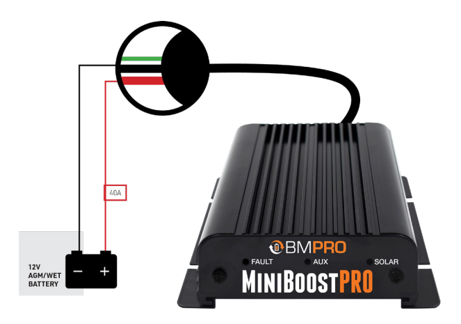
Figure 3: Selecting the 12V AGM/ WET Battery

When using the MiniBoostPRO to charge a 12V AGM/Wet Battery, terminate the green wire, leaving unconnected. This will set the output voltage at 14.4V.