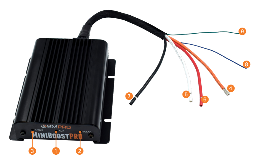
Figure 1: The MiniBoost PRO