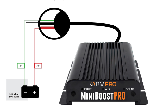
Figure 2: Selecting the 12VGel Battery

When using the MiniBoostPRO to charge a 12V Gel Battery, connect the green wire to the battery negative terminal or connect to the common negative. This will set the output voltage at 14.2V.